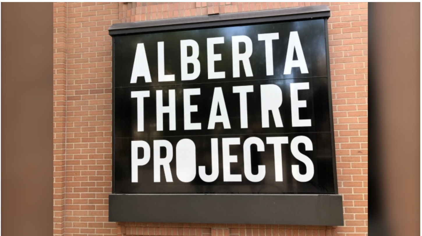
Alberta Theatre Project launches livestreamed readings of the Wizard of Oz