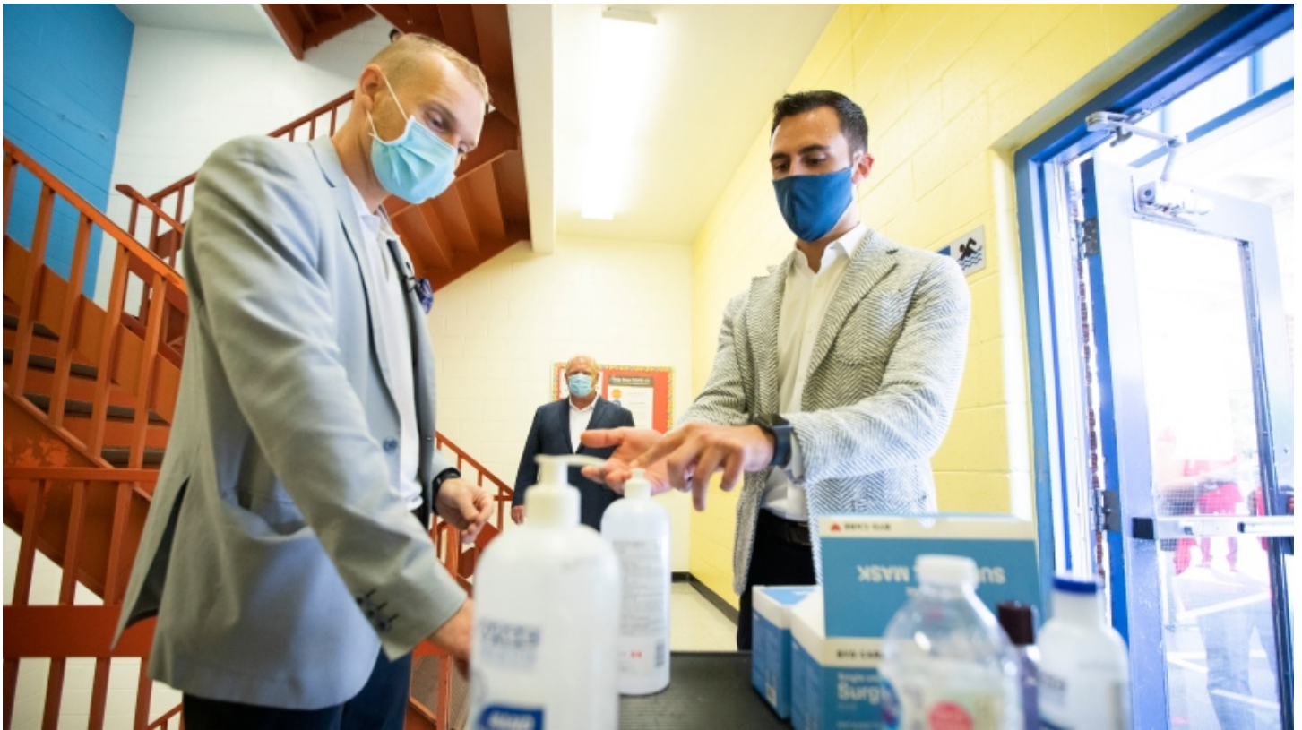
Ontario schools will not have an extended winter break this year