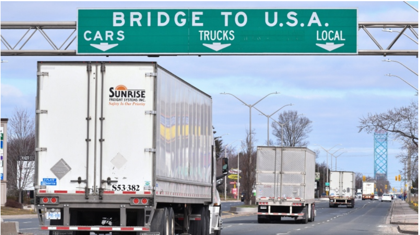
81 per cent of travellers to Canada since March exempt from quarantine, largely essential workers