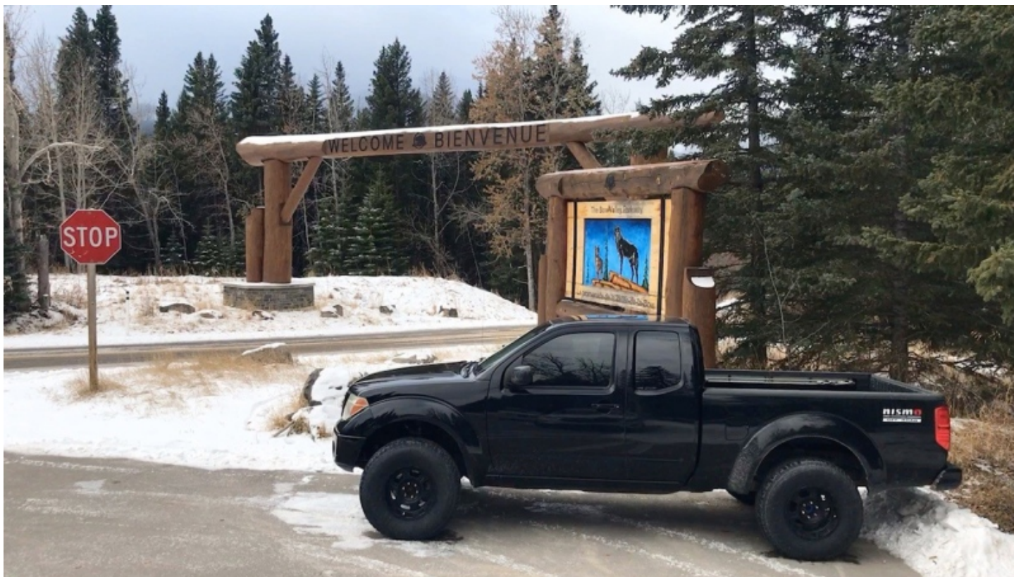
Banff National Park reopens popular scenic drive to all public vehicles