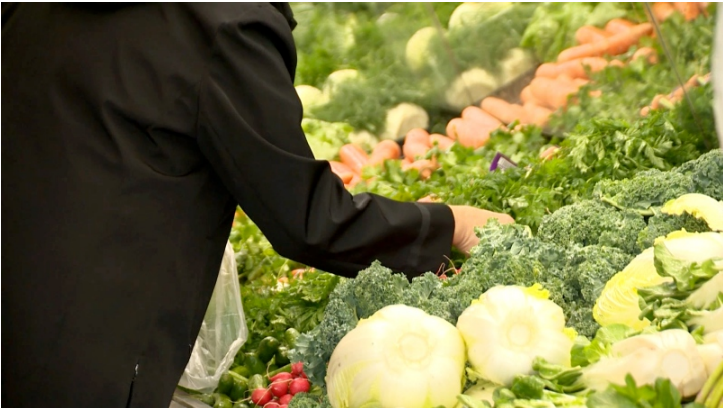
Meat and vegetable prices drive rise in inflation: StatCan