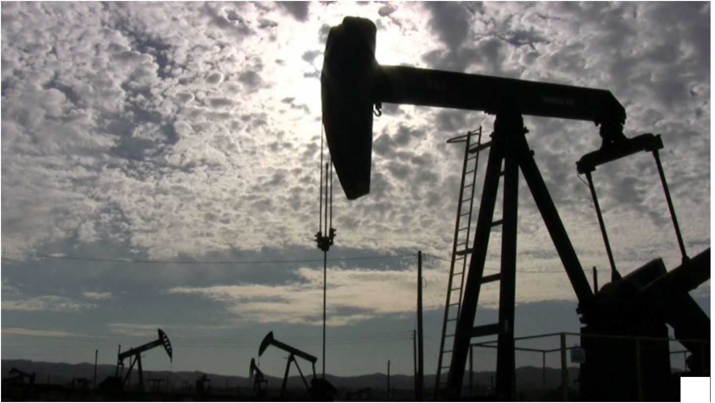
New energy initiative announcement for Alberta