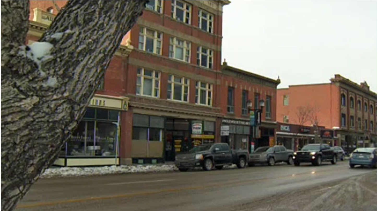
City launches holiday campaign encouraging Calgarians to support local businesses