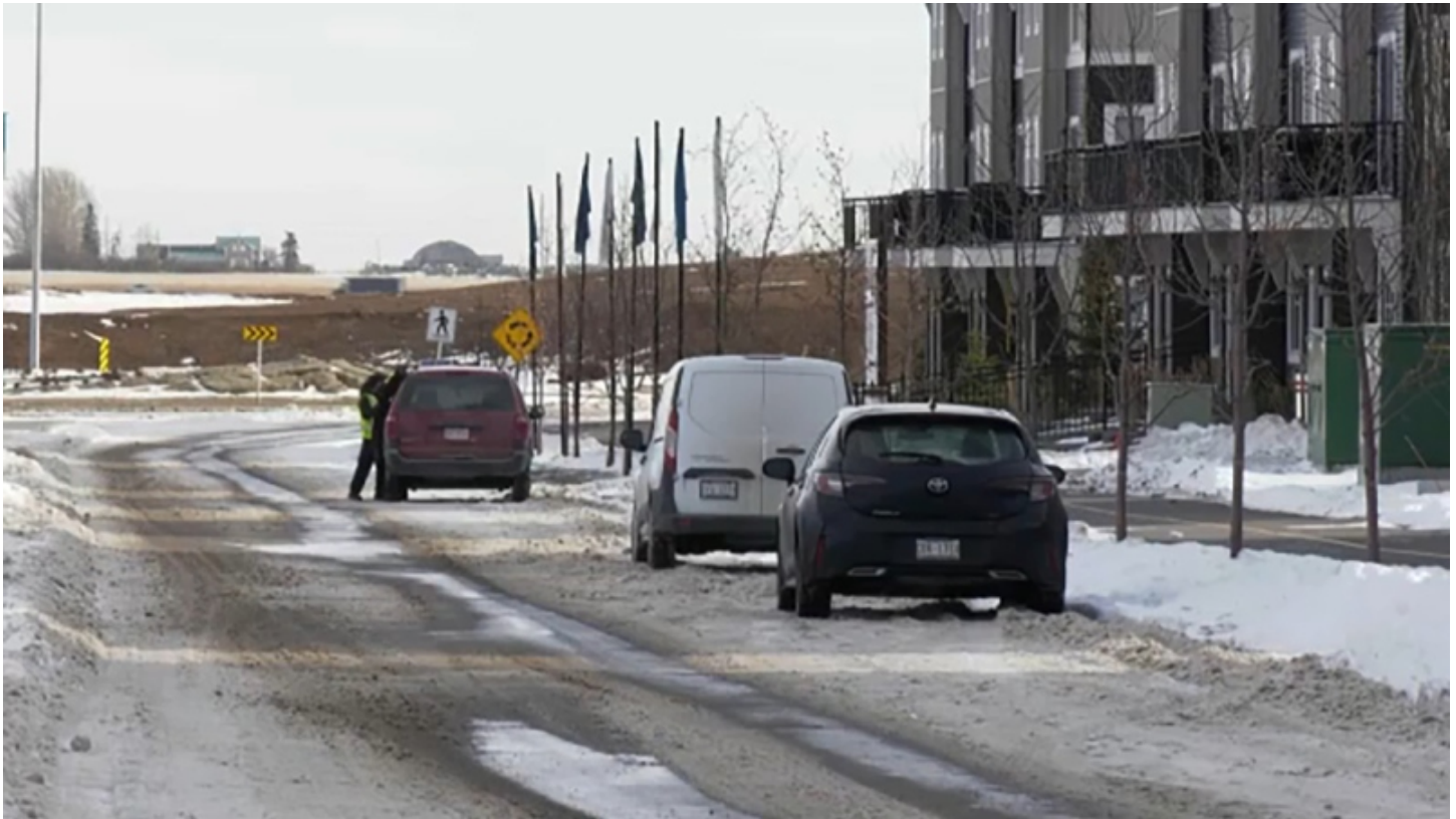
The tow job: Northeast Calgary community wakes up to discover cars missing from street