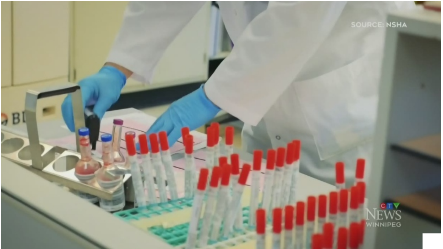
Concerns over province's handling of COVID