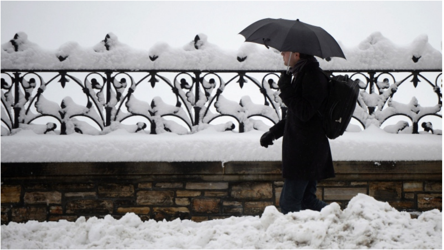
Winter could put a chill on Canada's top COVID-19 coping strategy