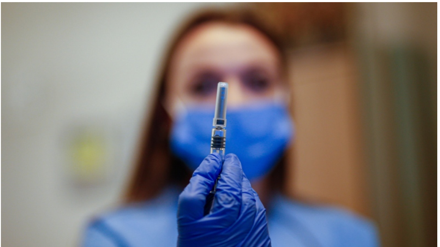
Potential vaccine news brightens dark day marked by rising COVID-19 cases, deaths