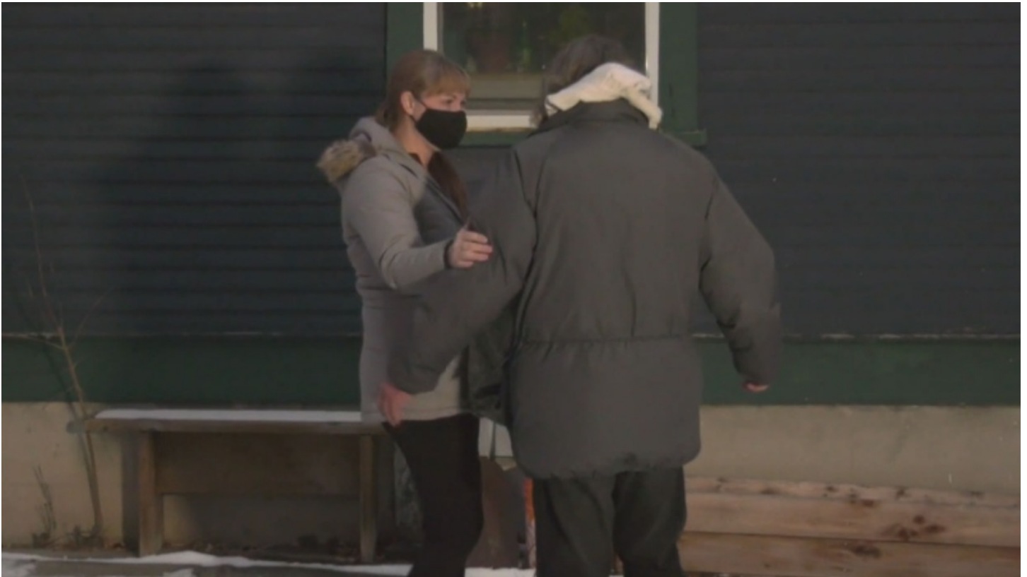
Calgary man enjoys fresh start after life on the streets