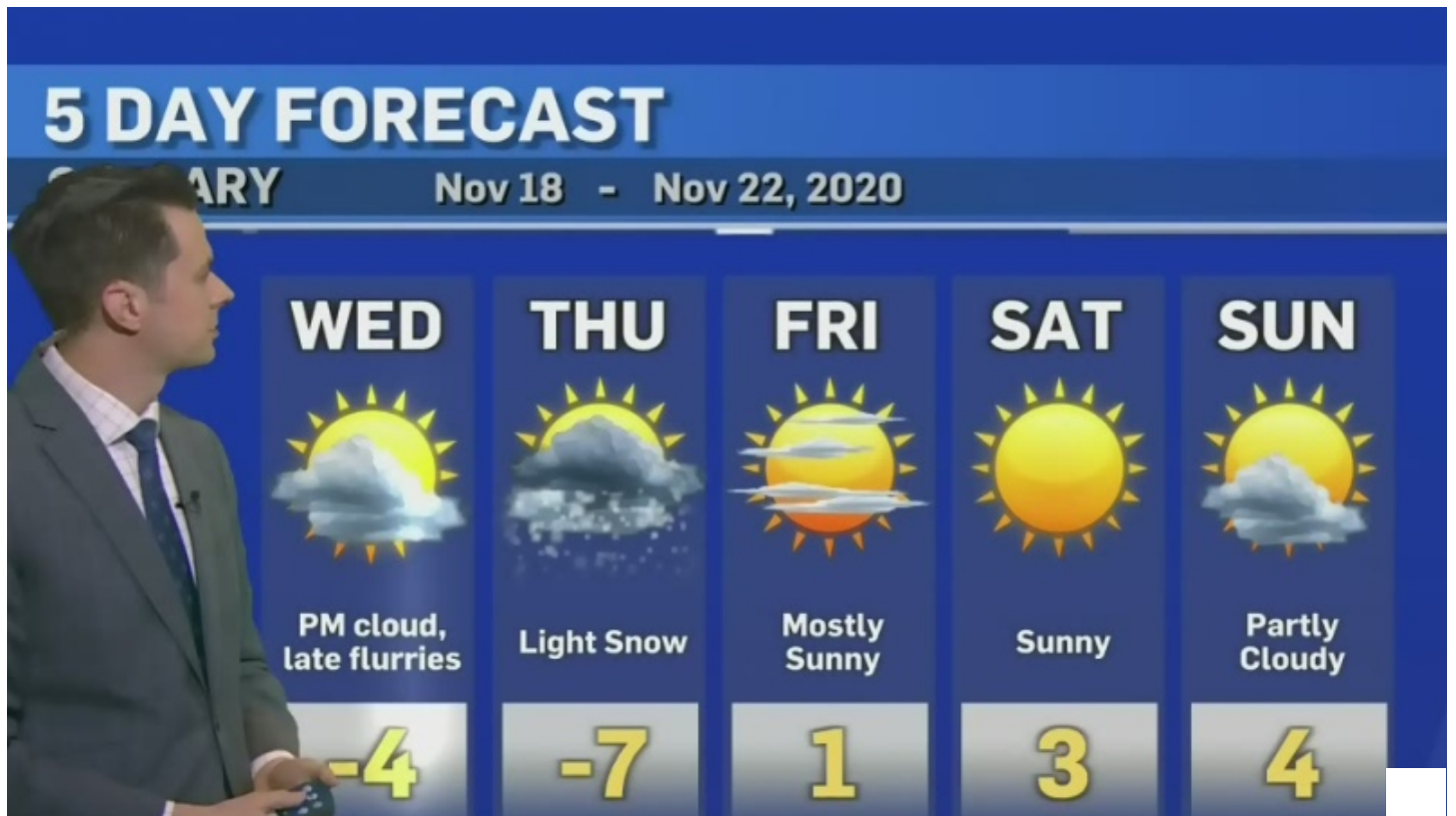
Wind could stymie warmth