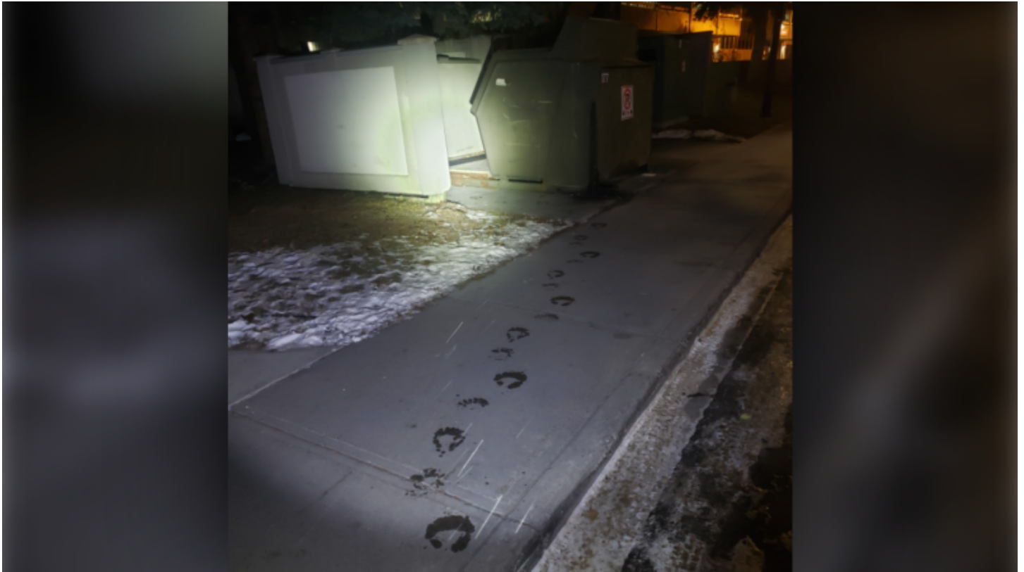
Greasy paw prints prompt Town of Banff to issue bear-related warning