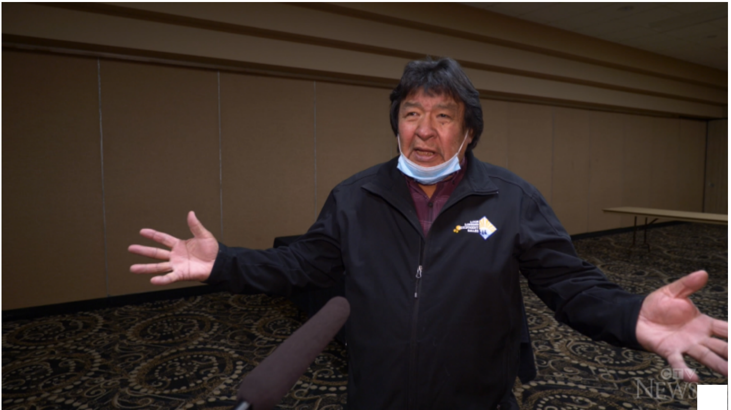
Former chief talks about life under a boil-water advisory