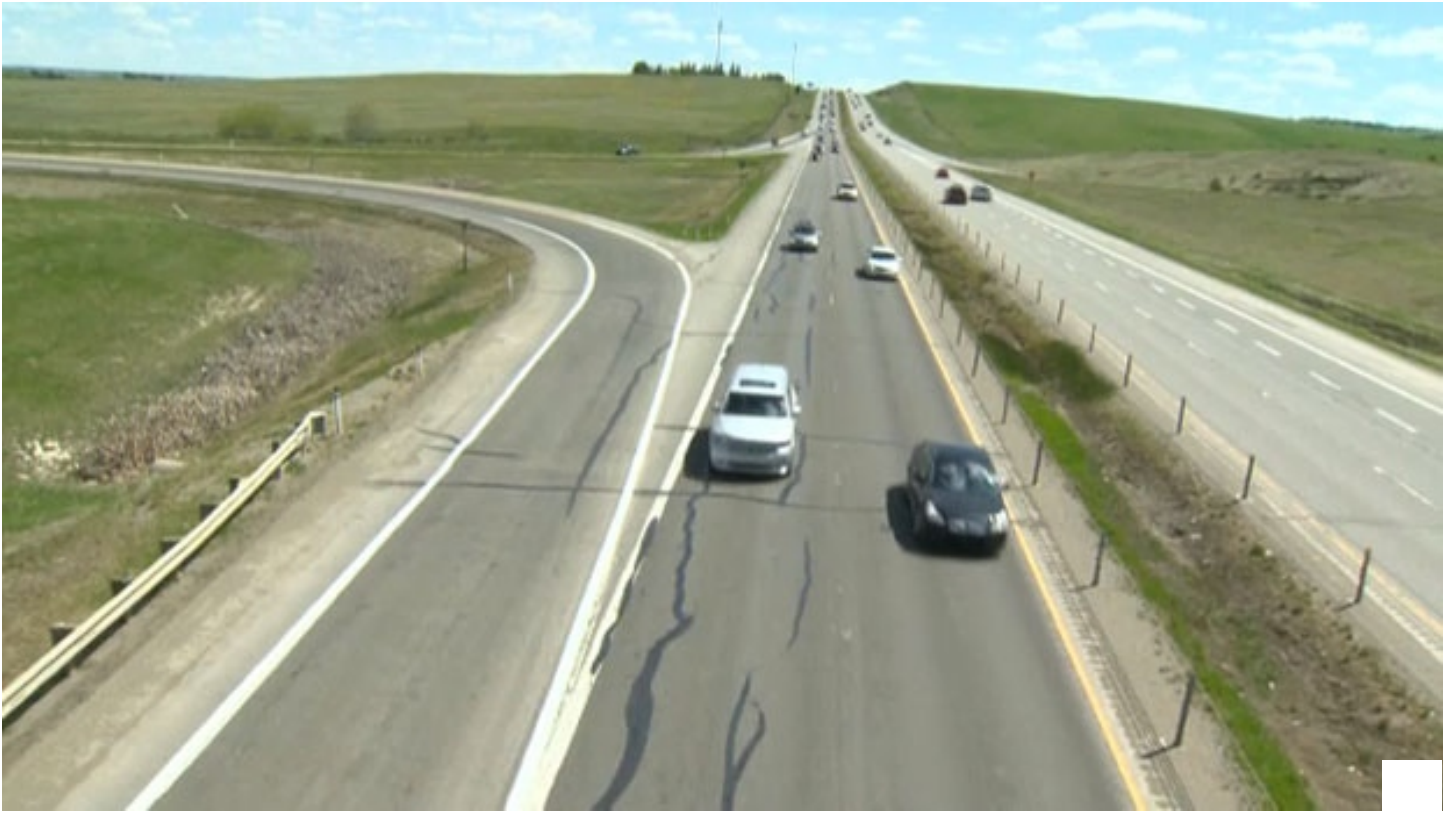
Charges in fatal crash