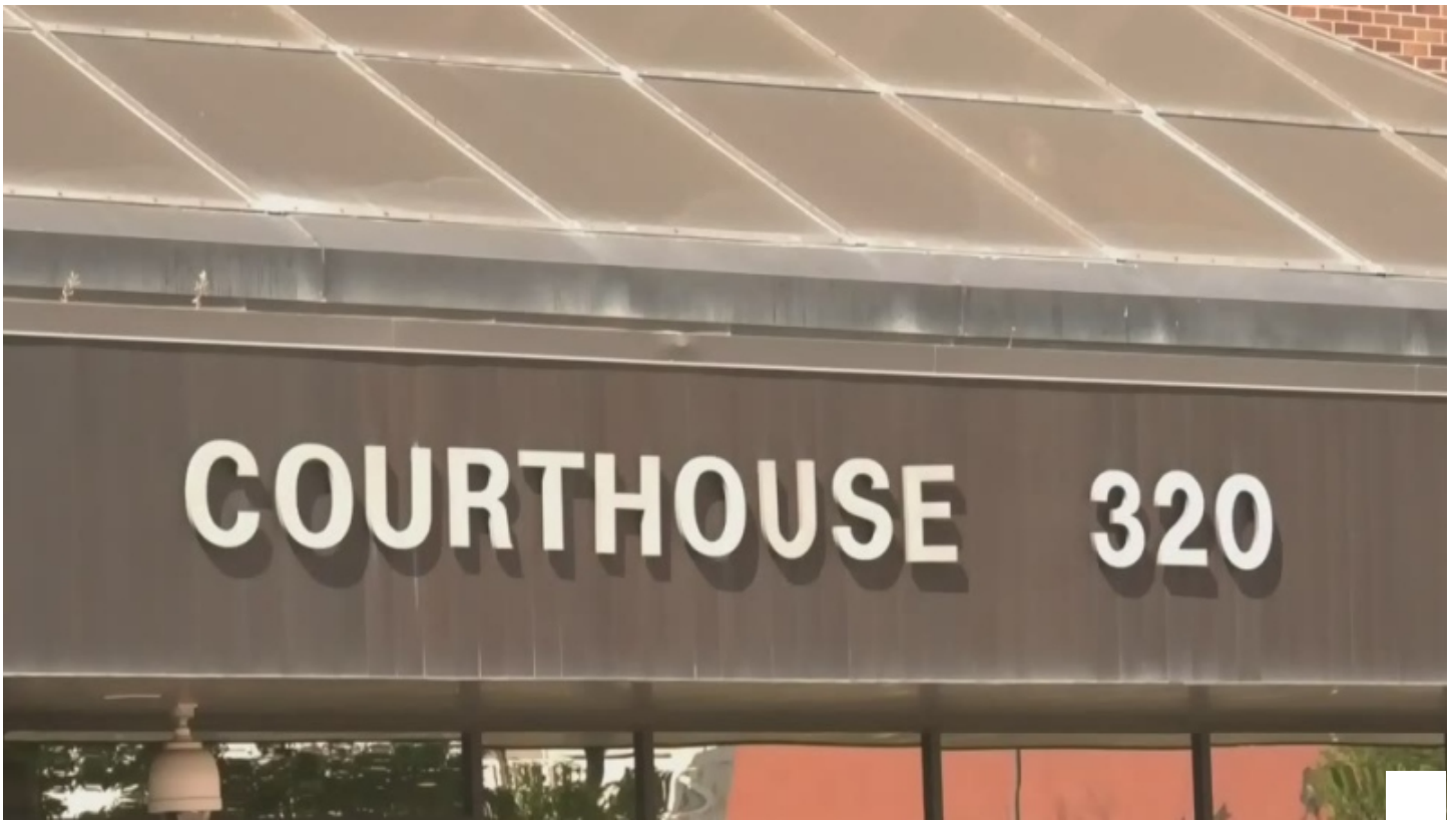
Pediatrician not guilty of sexual assault