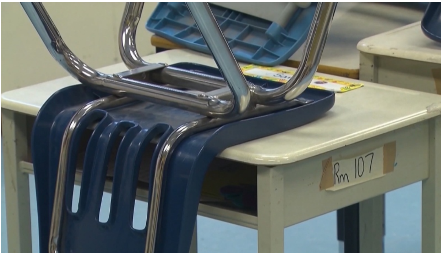
Extension of Christmas break not expected in Alberta schools