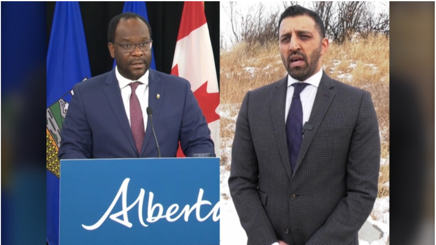
Calgary councillor calls out justice minister over 'lack of judgement' in police funding criticism