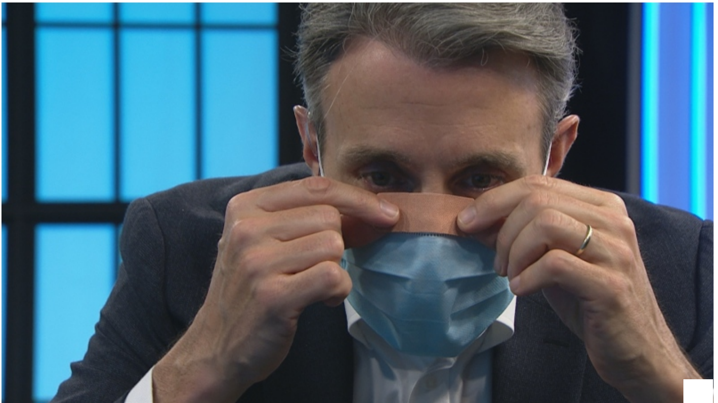
We try the Band-Aid mask tip and it works!