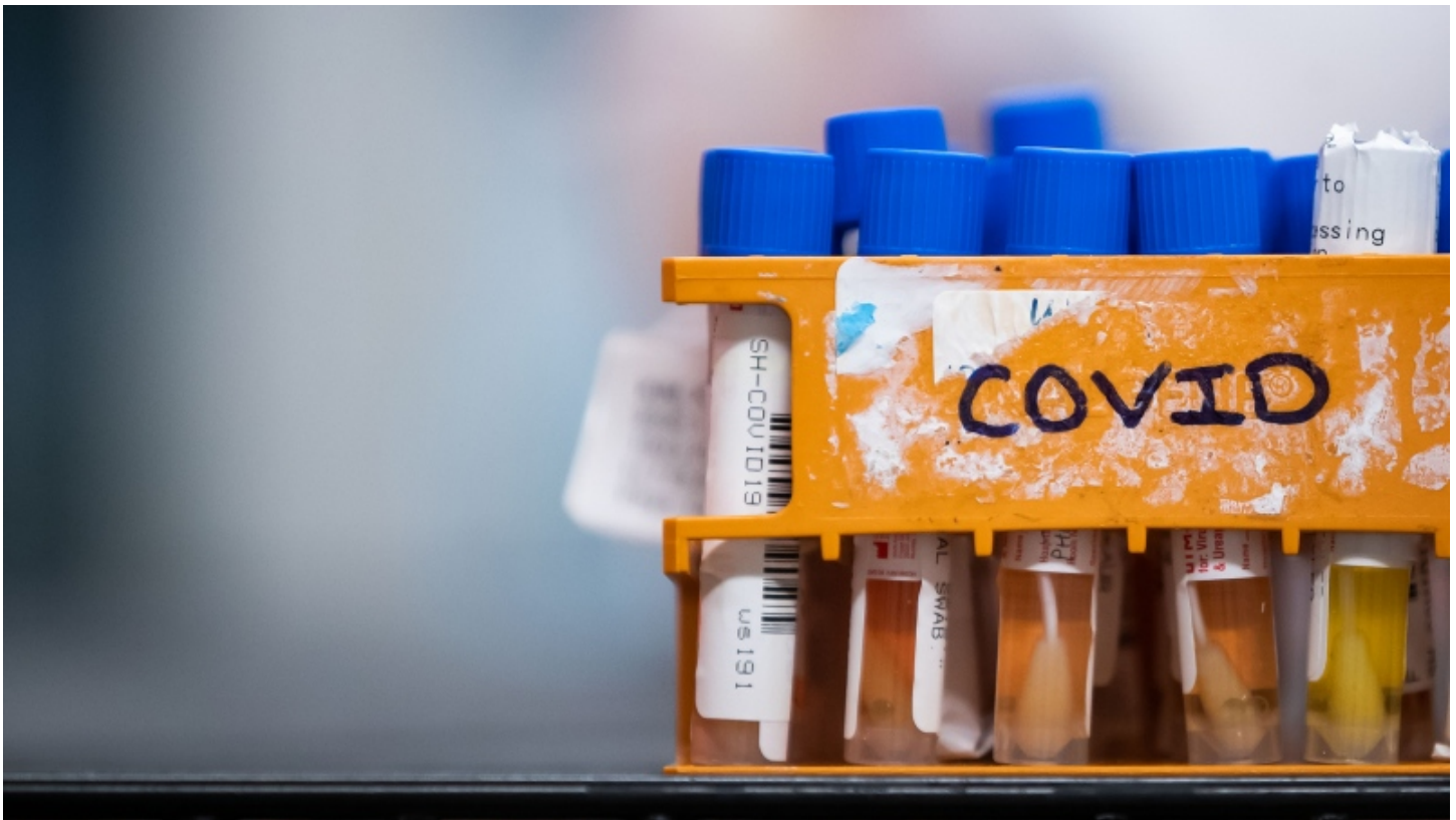
Origin unknown for 75% of COVID-19 cases in Alberta