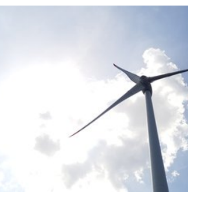
Numbers show we're