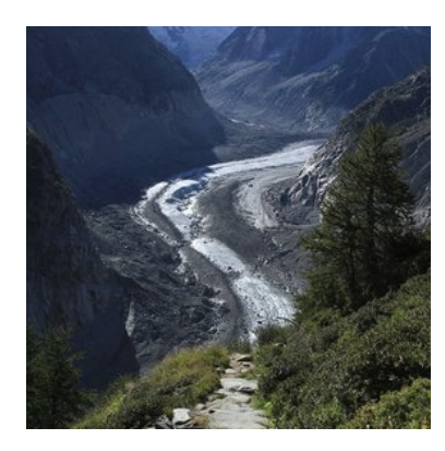
Go see the biggest